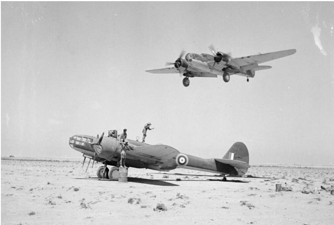
A Martin Maryland Mk II *AH284) of No 39 Squadron (RAF) undergoing servicing on an airstrip in North Africa as another aircraft returns from a reconnaissance flight.