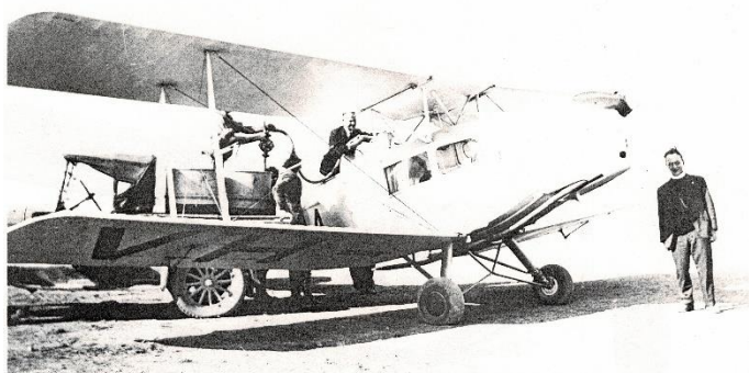
Figure 7 - BCAS’s DH83 Fox Moth being refuelled in Ceduna during its pre-war use prior to its placement at Kyancutta