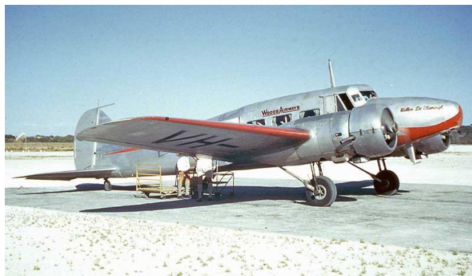
Figure 6 - Woods Airways Anson VH-WAB ‘Willem de Vlamingh’ (ex RAAF MG841) at Rottnest Island, undated

Bill also acted as some sort of intermediary in the purchase of three war surplus Ansons from the Commonwealth Disposals Commission in 1946 and 1947 from Port Pirie. He was acting for Jimmy Woods vii , who telegraphed the DCA in September 1947 “The two Anson aircraft MG271 and MH219, plus MG841 have passed out of the possession of Mr R. Bedford of Kyancutta SA and will be flown to Perth by me.” viii Woods used them to form Woods Airways, flying tourists over the 19 km hop to and from Rottnest Island until the DCA eventually grounded them in 1962. Precisely what Bill’s role was isn’t clear.