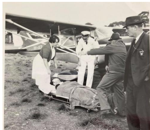
Figure 12 - Loading a patient on Beagle -UEP undated c.1963-1972