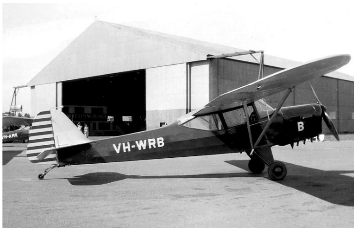
Figure 9 - J/1 Autocrat VH-WRB in Bankstown in 1956 - 3 years after Bill sold it

The Society's flying headquarters remained at Ceduna, from where it continued to operate with Alan Chadwick still as chief pilot with the DH84 Dragon and the Proctor until both were sold in 1957 to purchase the much larger (and faster) Lockheed 12A VH-BHH.