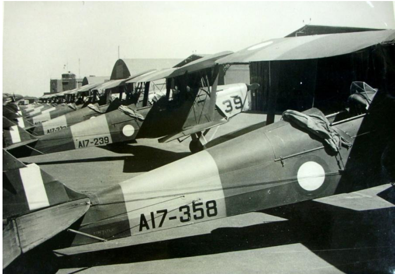
DH82 Tiger Moth Flying Trainer

After a few days leave David reported to No. 6 SFTS (Service Flying Training School) at Mallala SA on 23 September 1941.