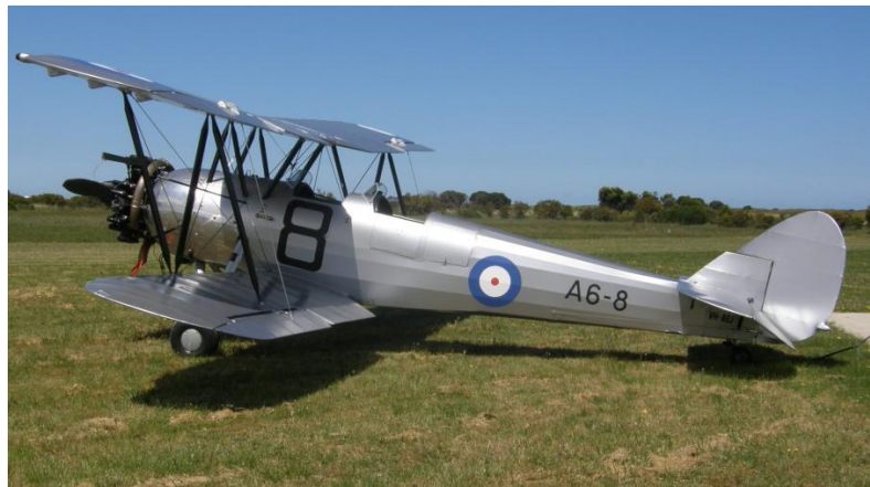
Avro Cadet Single-Engined Trainer

On 21 April 1942 he commenced duties at No 1 EFTS Parafield SA as a flying instructor and operated from there until 9 June 1942. Aircraft flown were the DH82 Tiger Moth.