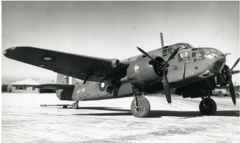
DAP Beaufort Twin-Engined Trainer